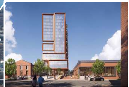
Steel Tech Redevelopment